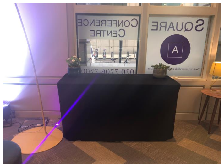
Table Top display area includes table, table cloth and power point. The trestle tables are 4.5''